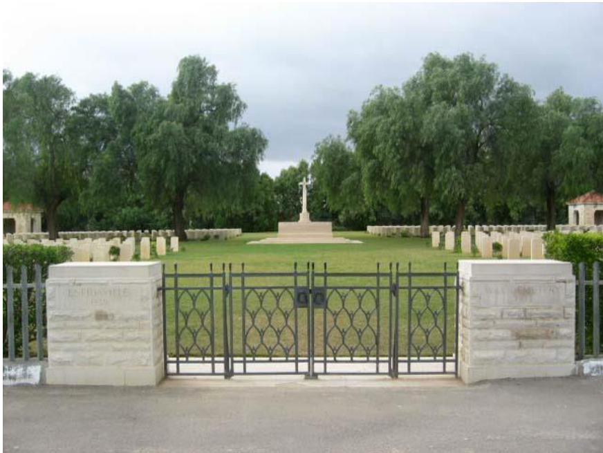
Enfidaville War Cemetery, Tunisia